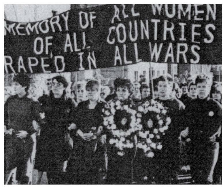
Ken Inglis, Sacred Places, Melbourne University Press, Melbourne, 2008, page 441