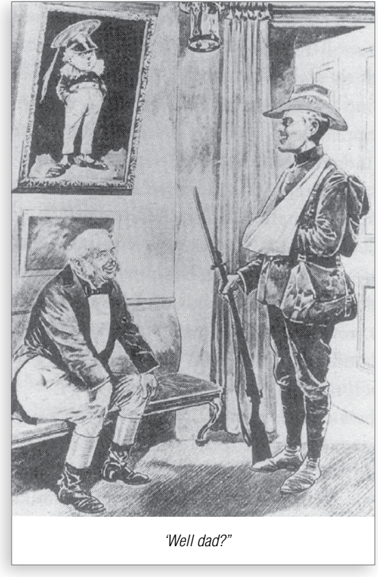
The Bulletin 13 May 1915